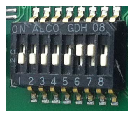
Slave radio with DIP switches 6 and 7 in the ON position.